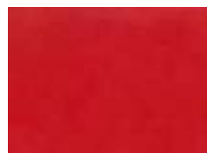
Red (Pan 1797C)