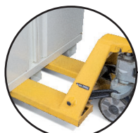
Moving by pallet truck (empty)