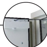
Self-closing door(s) with thermo-fuse