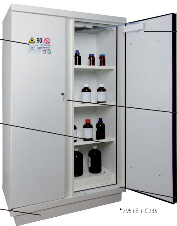
▲795+E + C235