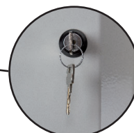
Key locking System