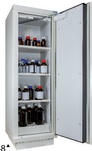
794+E + C148 ▲