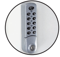
▲ Option Code lock SERCODE (1 per door)