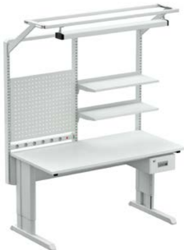
Concept ESD workstation 2