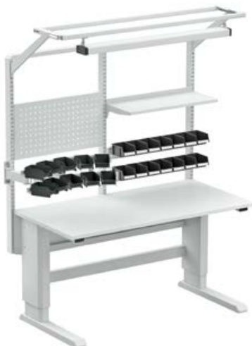
Concept ESD workstation 3