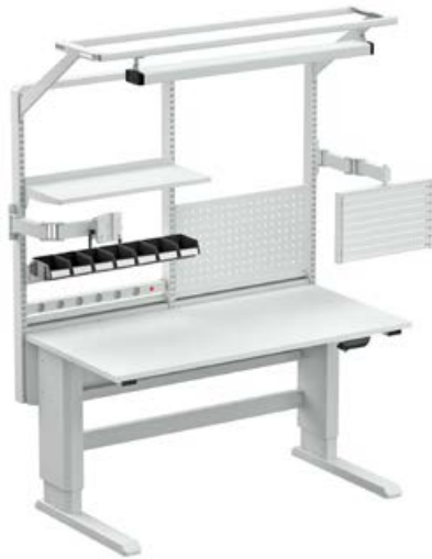
Concept ESD workstation 1