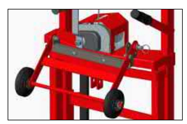
Optional Folding Loading Wheels