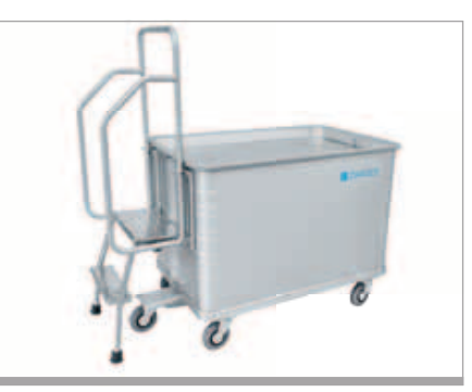
Storage and retrieval trolley, project-specific

Project-specific fabrication to meet your individual requirements.