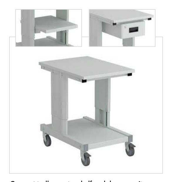
Concept trolley, extra shelf and drawer unit 30/15