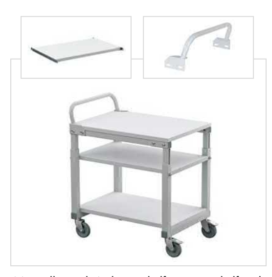
SAP trolley with AT lower shelf, LT extra shelf and PUSH handle

All the light-duty trolleys are equipped with four swivel castors (ø 100 mm), two of which have brakes.