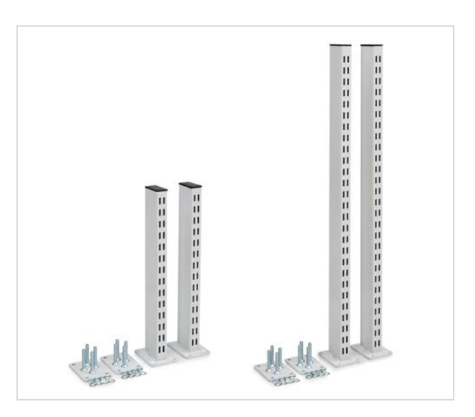
Upright Tube Pair with a flange

Wide range of accessories available for Treston Electric Desk