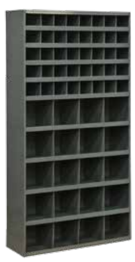
60 Opening Bin