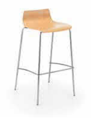
JUNO - polished wood veneer