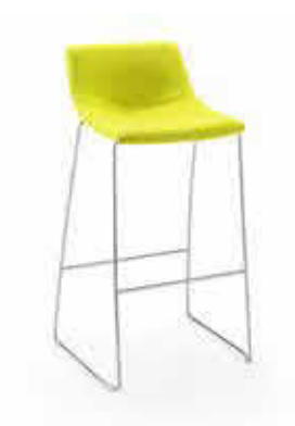
LUNA - fully upholstered stool