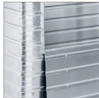
Peripheral beads and corner beads