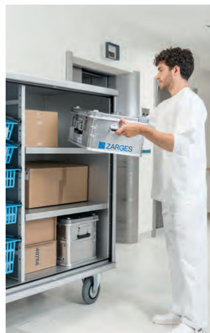
W 105 N cupboard trolley for transportation and storage of materials