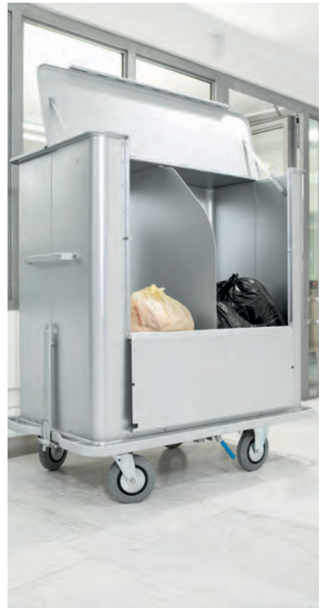
W 171 transport trolley for waste transport