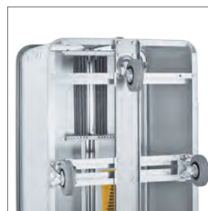
(2) Replaceable lifting elements