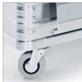
Castors suited to the application