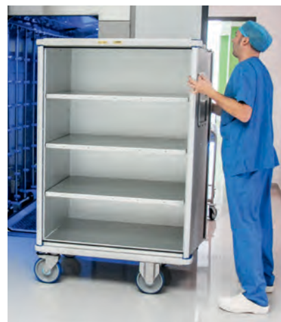
W 105 N cupboard trolley for operational areas