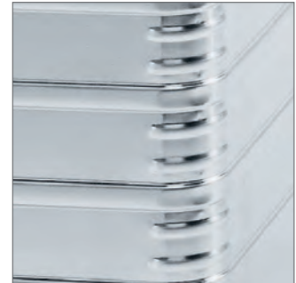
Peripheral beads and corner beads