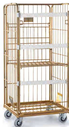
GW 1700 with tensioning straps