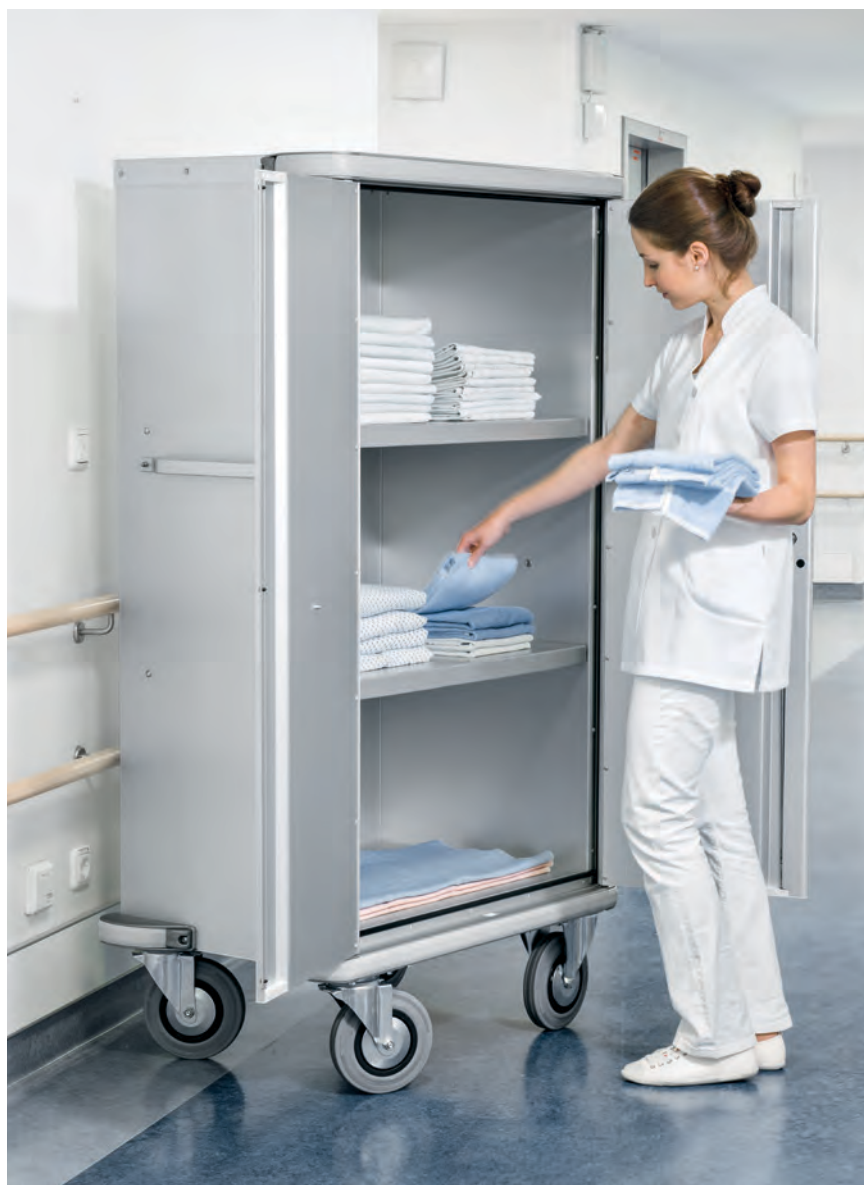
W 105 N cupboard trolley for laundry supplies