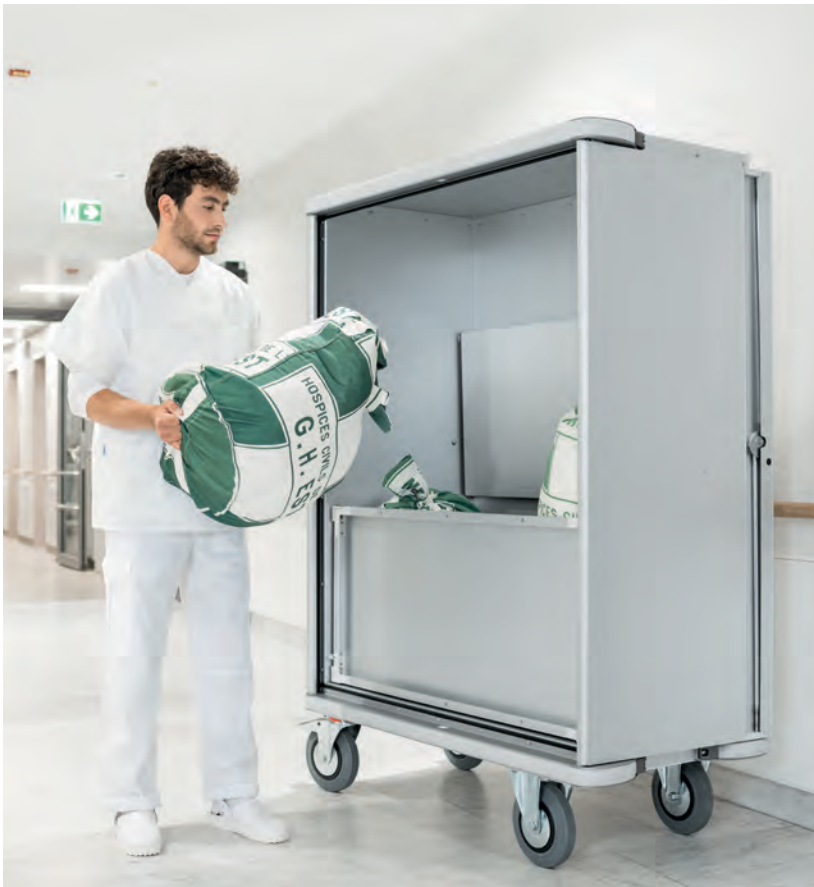
W 105 N cupboard trolley for laundry transport