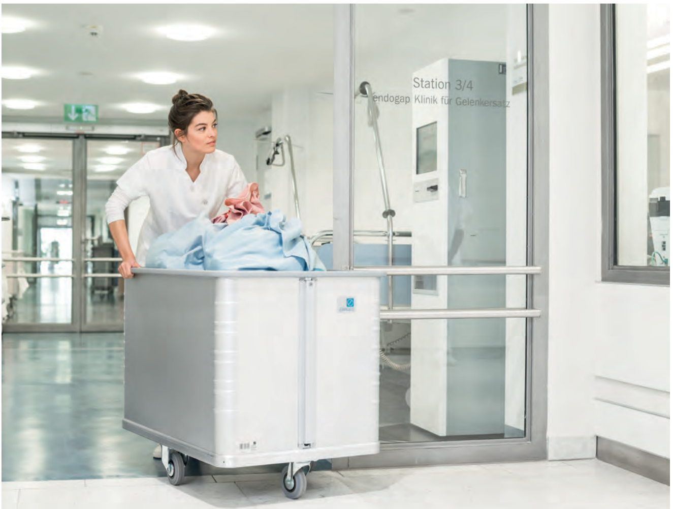
W 161 spring-loaded trolley for ergonomic working