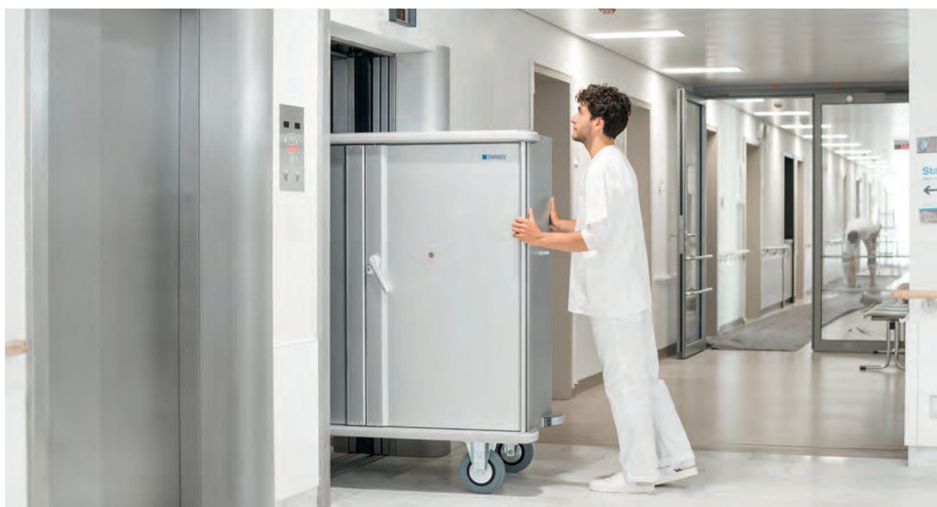
Internal supply with the W 105 N cupboard trolley