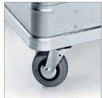
Castors suited to the application