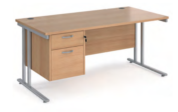
Straight Desks with Two Drawer Pedestal

Straight Desks with Two & Three Drawer Pedestals