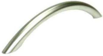
Sweep Handle Metal SD201 Chrome Finish