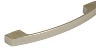
Curved Bow Handle Steel SD204 Aluminium Finish