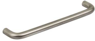
Ergo Hoop Handle Steel SD205 Matt Chrome Finish