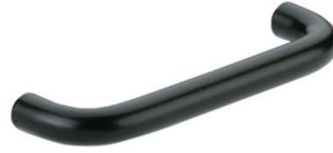
Ergo Hoop Handle Steel SD206 Black Finish