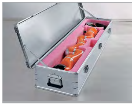
Antistatic foam insert