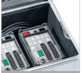
Wide variety of applications