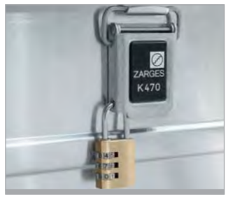
Fastener with K470 clip and shackle lock