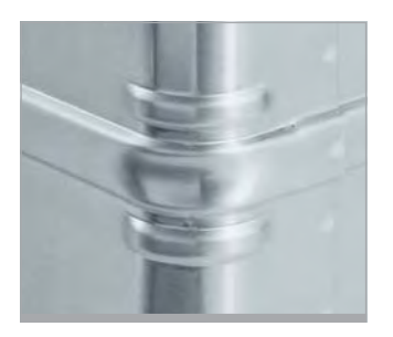
B Depending on size, beading all round and corner beads for added stability