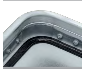
Sealing function also included in corner areas

Protected against wear, overloading and squashing