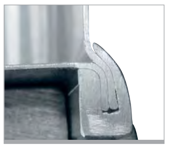
Edge, base, lid profilesection frame made from full profile sections, joint fully welded to sheet metal with permanent bonding through high-strength positive locking