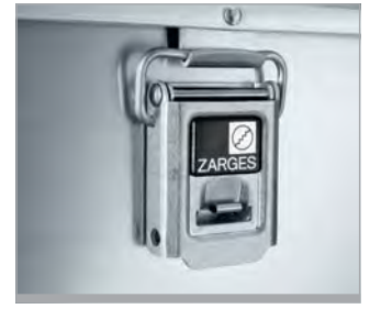
Fastener with spring anti-opening feature