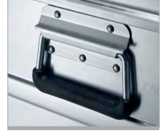
6 Wider hand rest for more ergonomic design

Sealed at the ends to prevent fraying. Will not be torn out under heavy loads. Attached with special rivets (with extra-large heads)