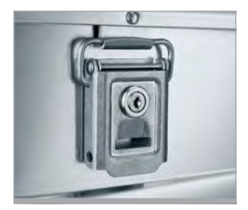
Fastener with plug lock

The ZARGES Comfort fasteners can be equipped with a mortise lock or with spring anti-opening feature. They can also be secured with a shackle lock or lead seal.