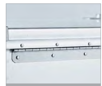
3 Stainless steel hinge strips riveted into the sheet metal jacket and lid full-profile section (protection against tearing out)