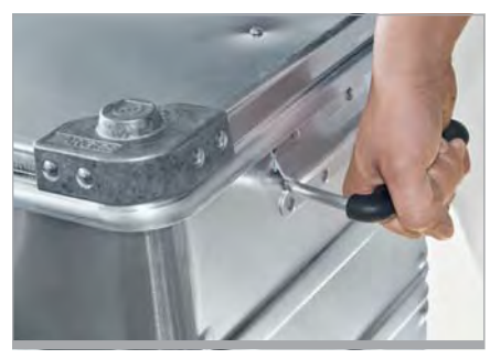
\label{thm:constraints} \mbox{Ergonomically shaped, extra-wide ZARGES Comfort handles}

Video for K 470 and other products available at Merlin Industrial Products