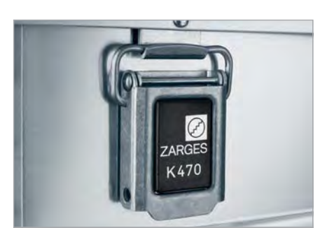
Durable ZARGES Comfort fastener