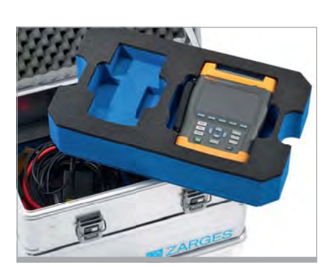
Foam inserts that fit perfectly