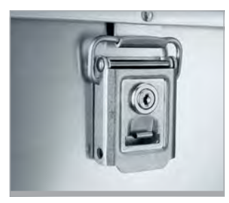
Fastener with spring anti-opening feature and plug lock