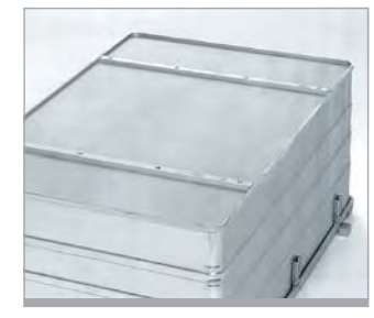
9 Skid bars made from sturdy aluminium sections on cases from outside dimensions 1,200 mm × 800 mm (additional reinforcement)