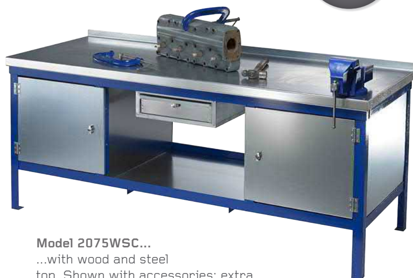
Model 2075WSC... ...with wood and steel top. Shown with accessories: extra cupboard, drawer and 150mm (6") vice.