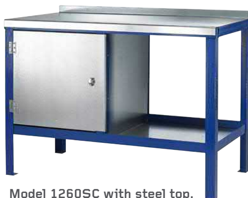
Model 1260SC with steel top.