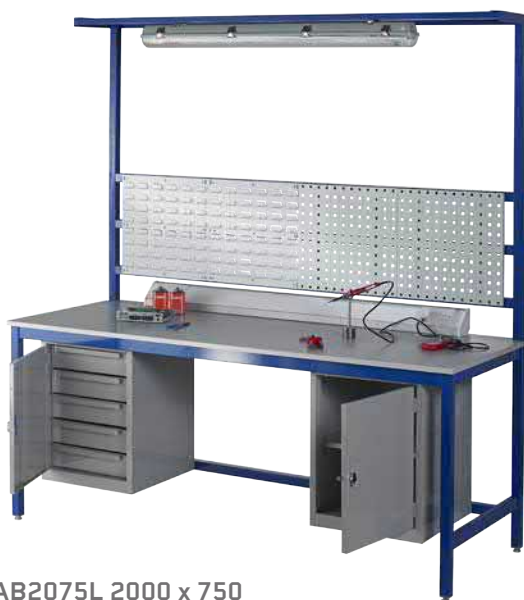
Model AB2075L 2000 x 750 Laminate top medium duty workbench illustrated with: 5 drawer unit, cupboard, louvre and tool panels with support bars, light rail, fluorescent light and bench top trunking with two twin sockets (supplied unwired).