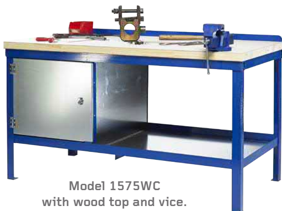
Model 1575WC with wood top and vice.

QUALITY MATERIALS AND QUALITY WORKMANSHIP