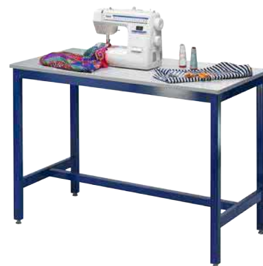
Model AB1260L 1200 x 600 Laminate top medium duty workbench.