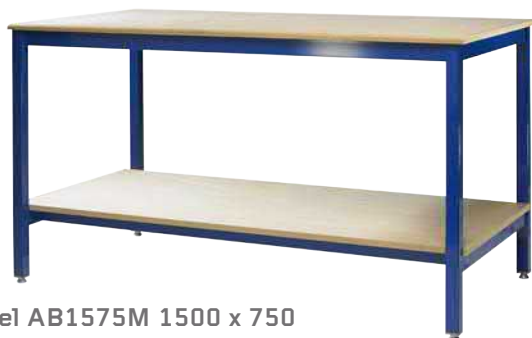
Model AB1575M 1500 x 750 with extra bottom shelf.