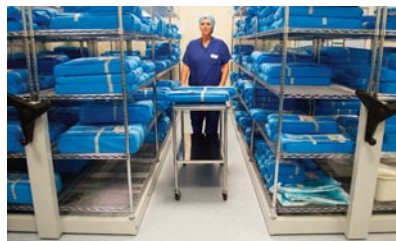
We have a range of static and mobile shelving CSSU storage options to meet your requirements.