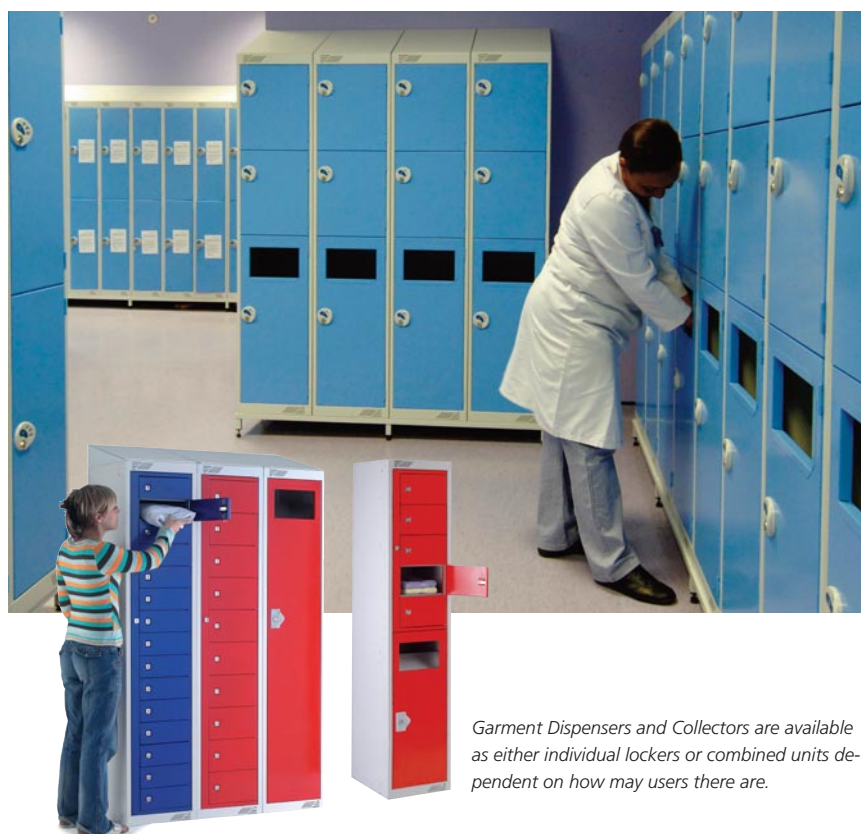
Garment Dispensers and Collectors are available as either individual lockers or combined units dependent on how many users there are.

Not only do our garment lockers dispense clothing, but they also allow for the collection of used workwear at the end of a day or shift. Workers simply post their used garments through the adjacent or combined collection locker; these items then collect in a laundry bag supplied by the laundry service.