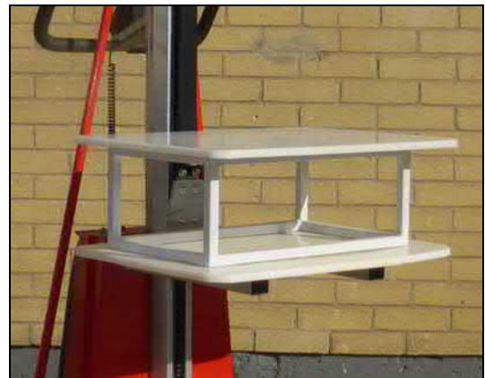
200mm Raised Frame