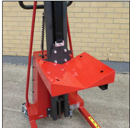
V Block – EP03 Capacity: 250kg