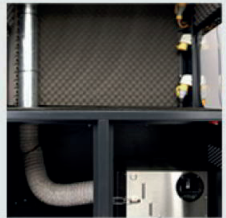
Optional extra of air filtration or dust extraction system