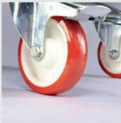
Heavy-duty swivel wheels