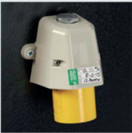
Side 110v inlet sockets

Optional Air filtration or dust extraction system.