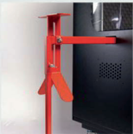
Adjustable extending support arms