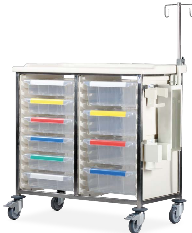
CTS2/10/6S4D - shown with optional CT/IV, CT/CR2, GMBH/15 & CT/ALC