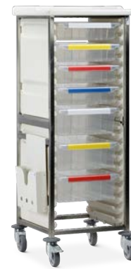
CTS1/14/4S3D - shown with optional CT/DH/A4