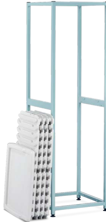
Easy disassembly & cleaning