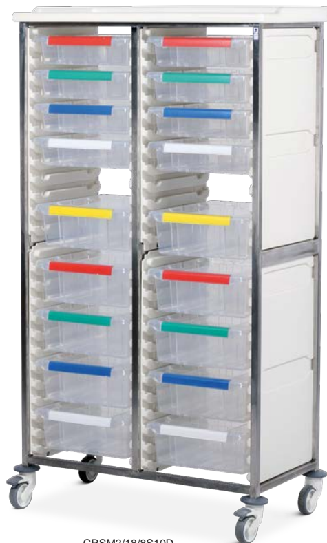
CRSM2/18/8S10D - shown with optional C004