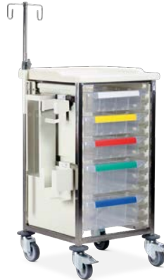
CTS1/10/3S2D - shown with optional CT/IV, CT/CR2, GMBH/15 & CT/ALC