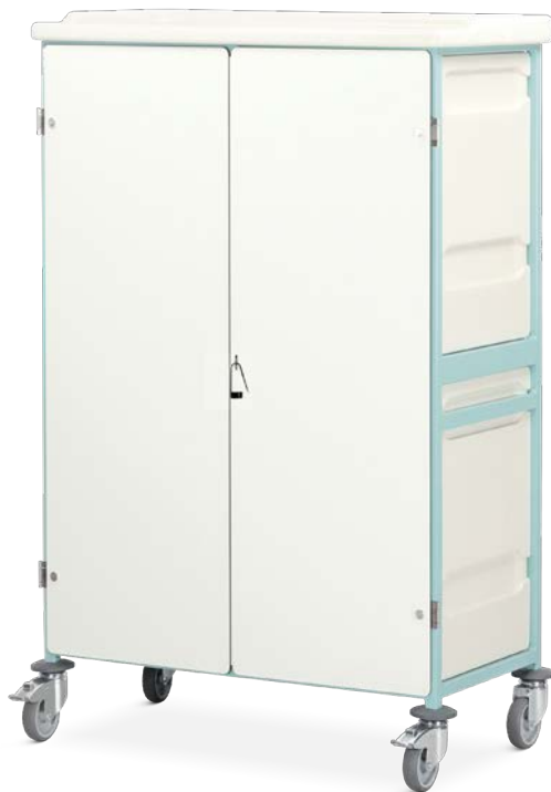
CTM2/14/10S6D - shown with optional CTD2/14SS (Double door fitted with Security Seal Lock)