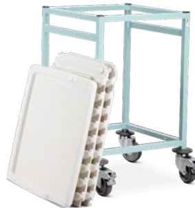
Easy disassembly &amp; cleaning