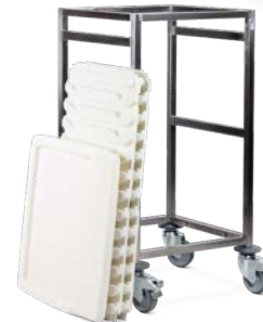
Easy disassembly & cleaning