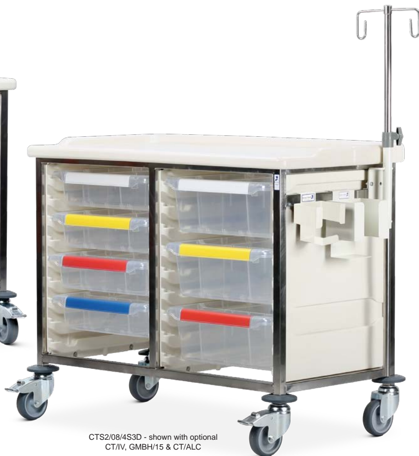
CTS2/08/4S3D - shown with optional CT/IV, GMBH/15 & CT/ALC