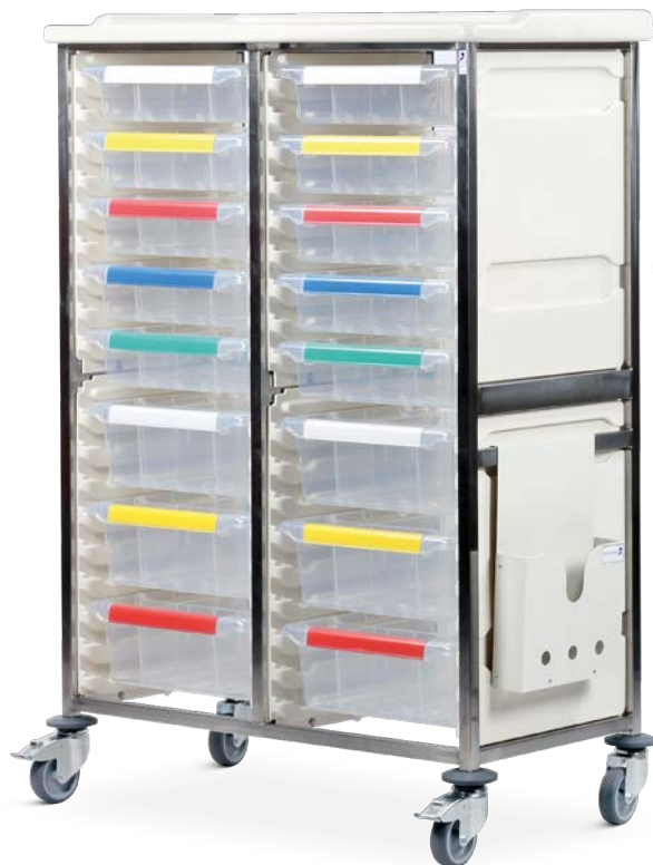
CTS2/14/10S6D - shown with optional CT/DH/A4