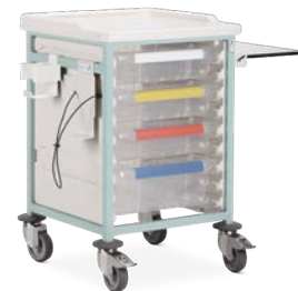
CTM1/08/3S1D - shown with optional CT/WF, SBH/15 &amp; CT/ALC