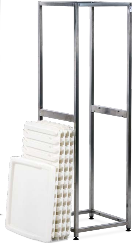
Easy disassembly & cleaning