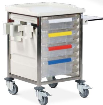
CTS1/08/3S1D - shown with optional CT/WF, CT/ALC &amp; GMBH/15