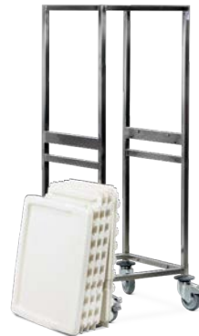
Easy disassembly & cleaning