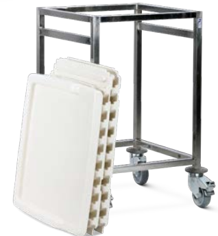
Easy disassembly &amp; cleaning