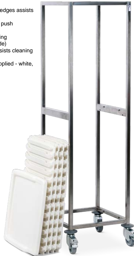
Easy disassembly & cleaning