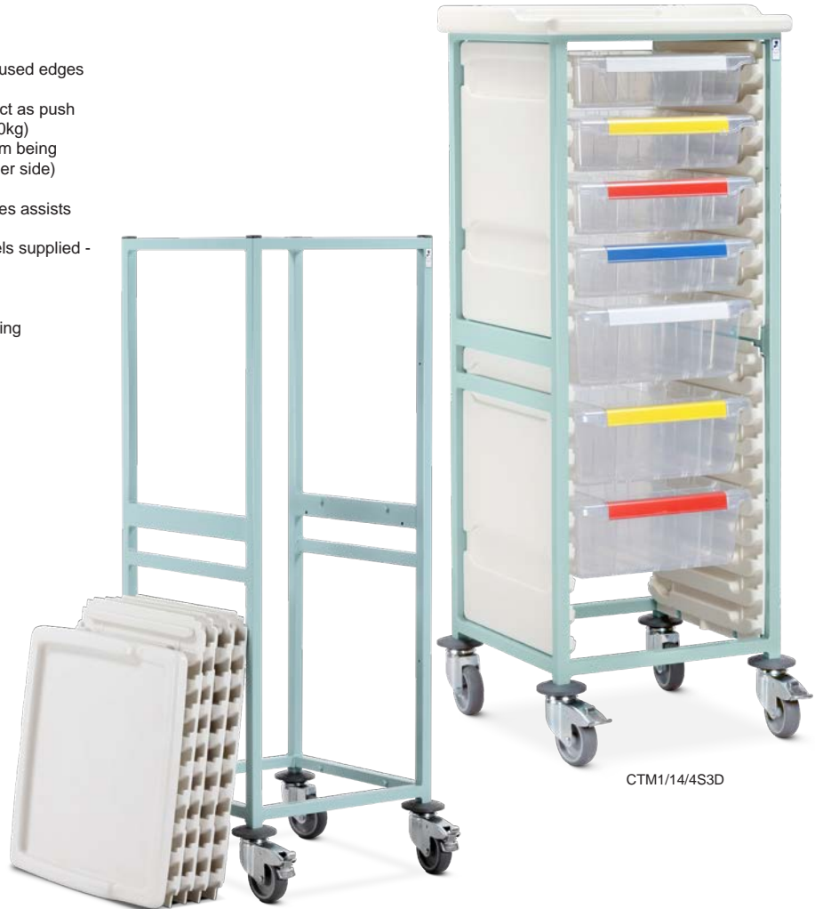
Easy disassembly & cleaning