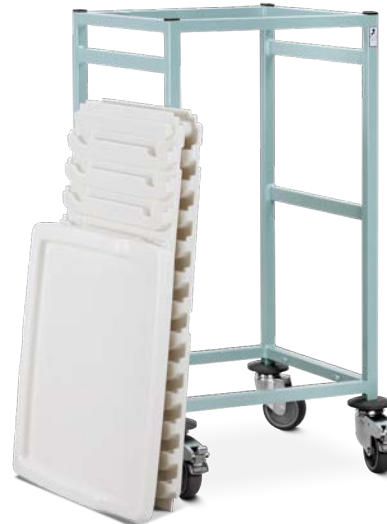
Easy disassembly & cleaning