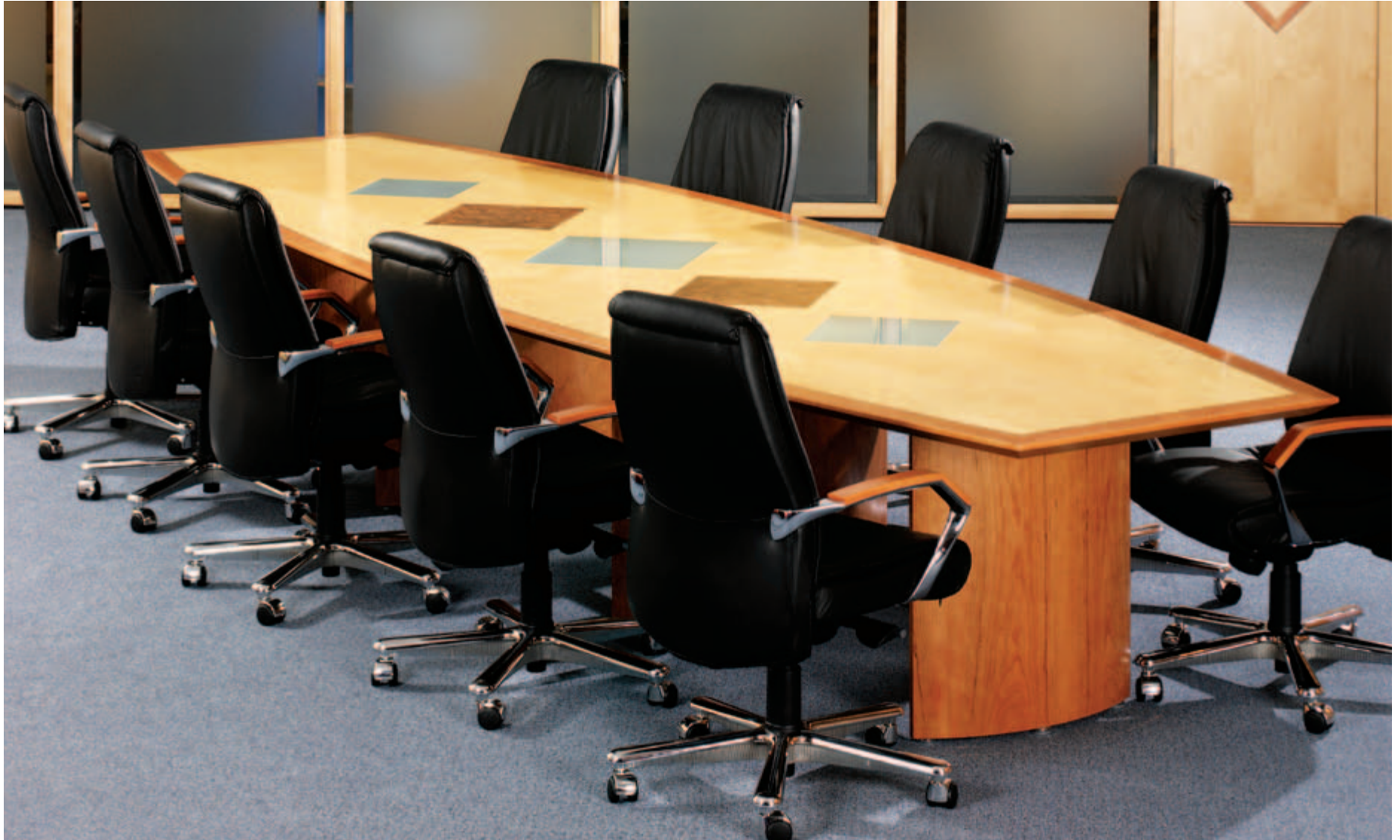
Boat shape table in birdseye maple with inset burr walnut & etched glass panels. Cherry picture frame border.