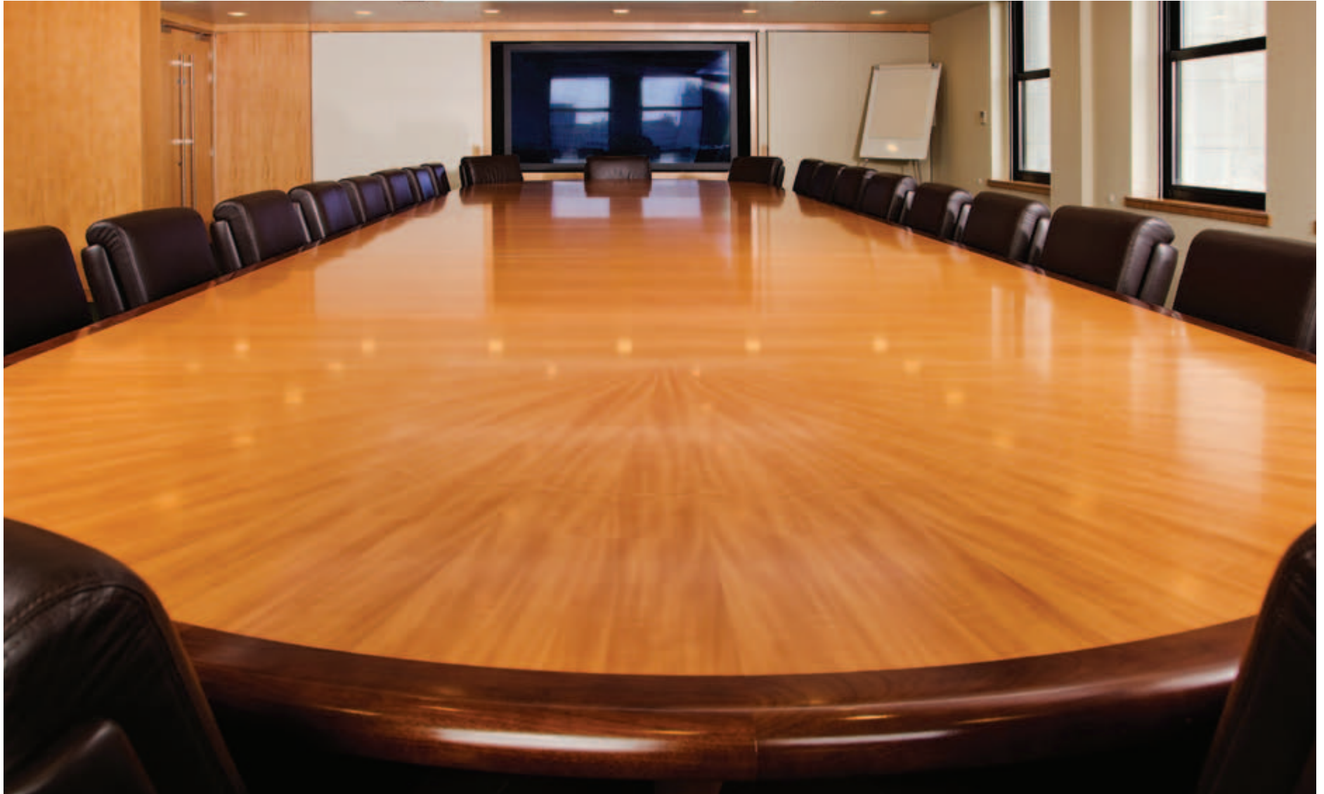
Racetrack table in figured anigre veneer with a radial pattern to ends. 80mm bullnose edge detail in solid walnut.