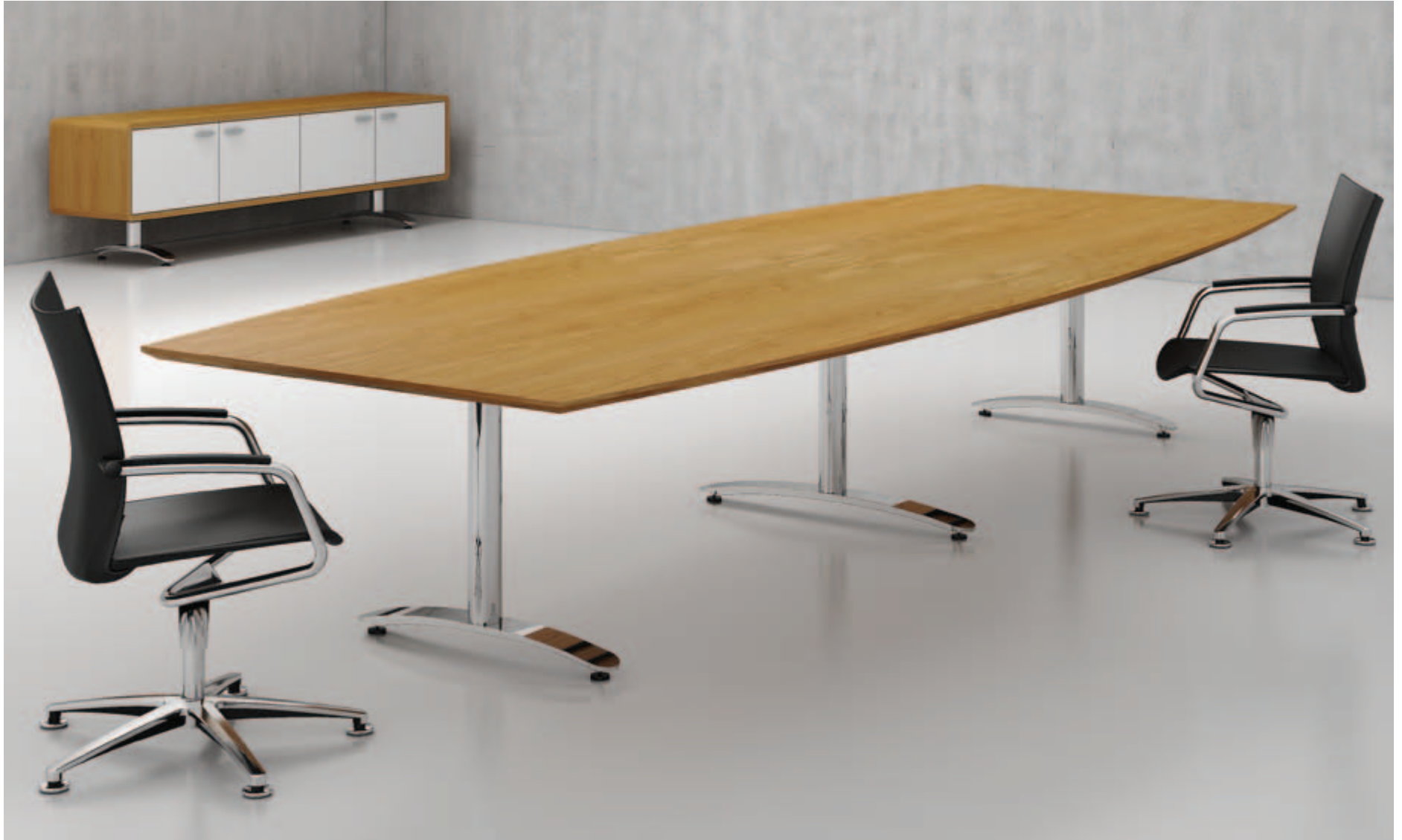
Crown cut oak veneer top with undercut edge and polished chrome base. Pictured with a Glide credenza in oak with white doors.