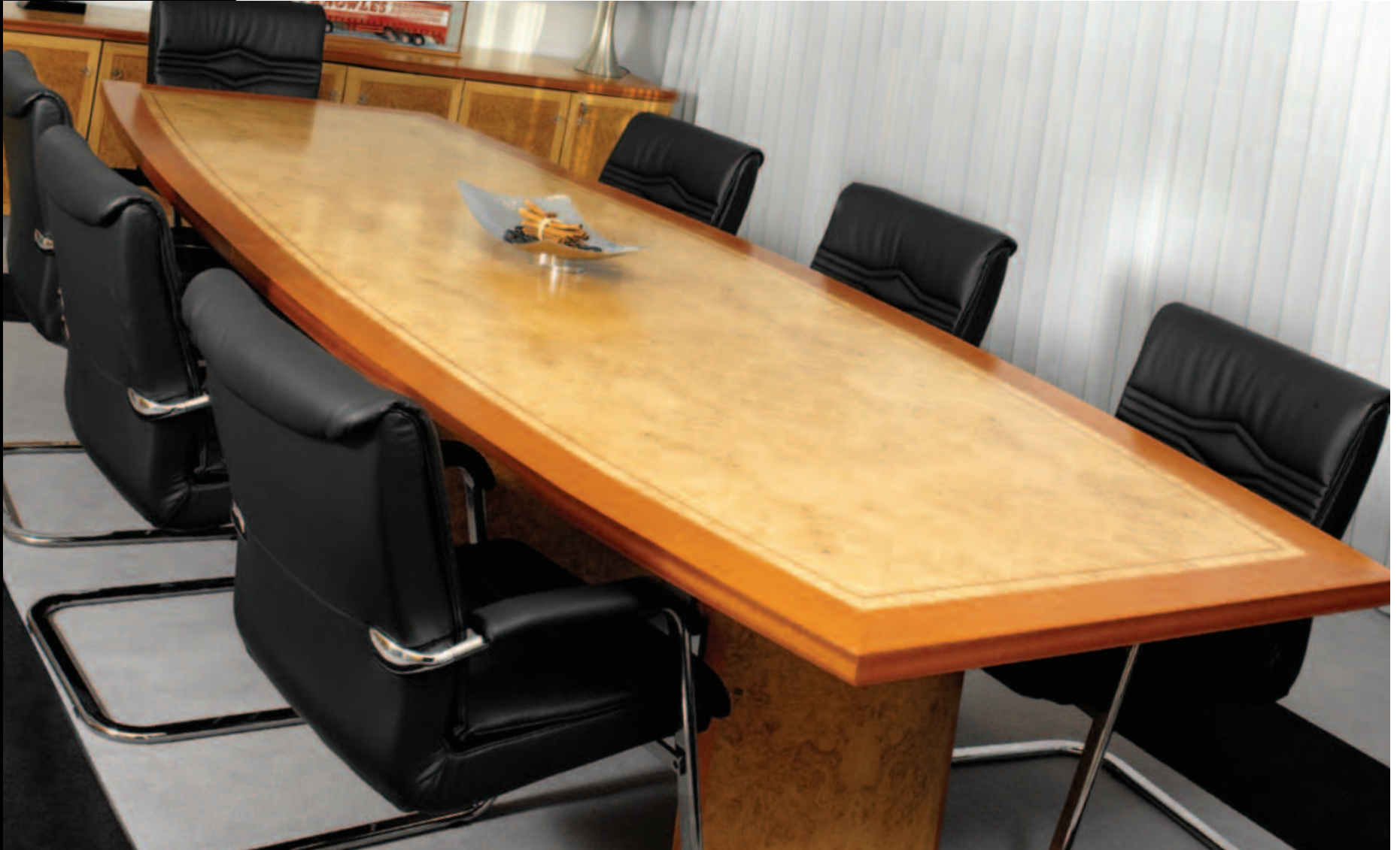
Burr oak veneer with mahogany inlay and picture frame border. Aerofoil base. Matching fitted credenza.