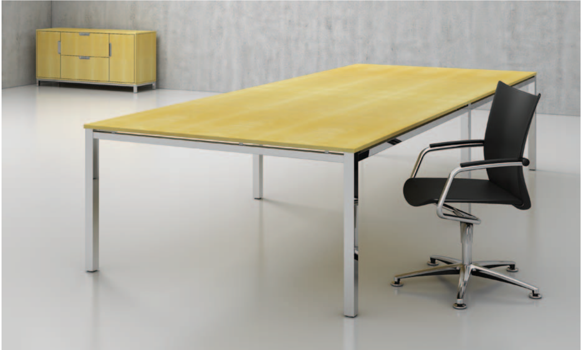
Figured sycamore veneer with polished chrome leg frame. Flite combination credenza unit with doors and drawers.