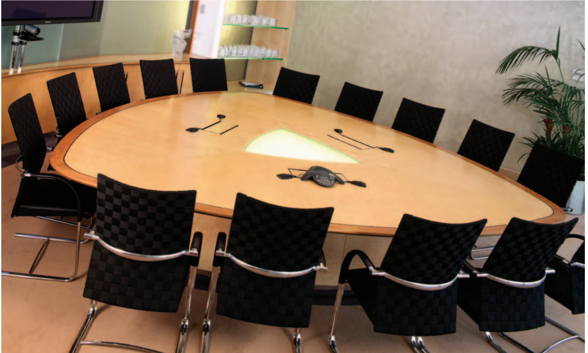
Birdseye maple veneer with black inlay and cherry picture frame border. Undercut edge detail. Inset illuminated glass to centre. Discreet flip up access for connections. Removable panels in base for cabling .Curved bespoke AV wall.