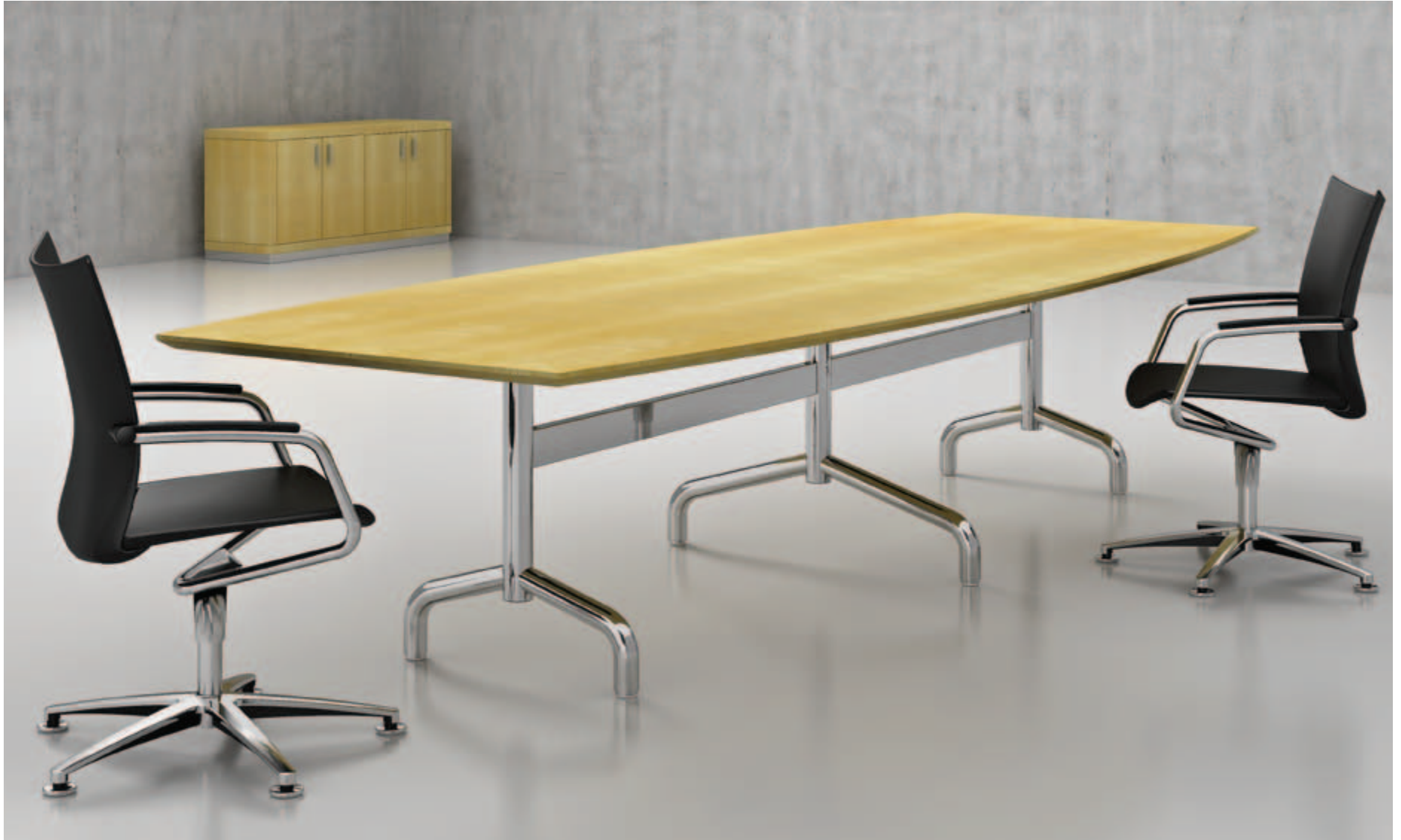
Figured sycamore veneer top with polished chrome base. Pictured with the Elements 4 door credenza.