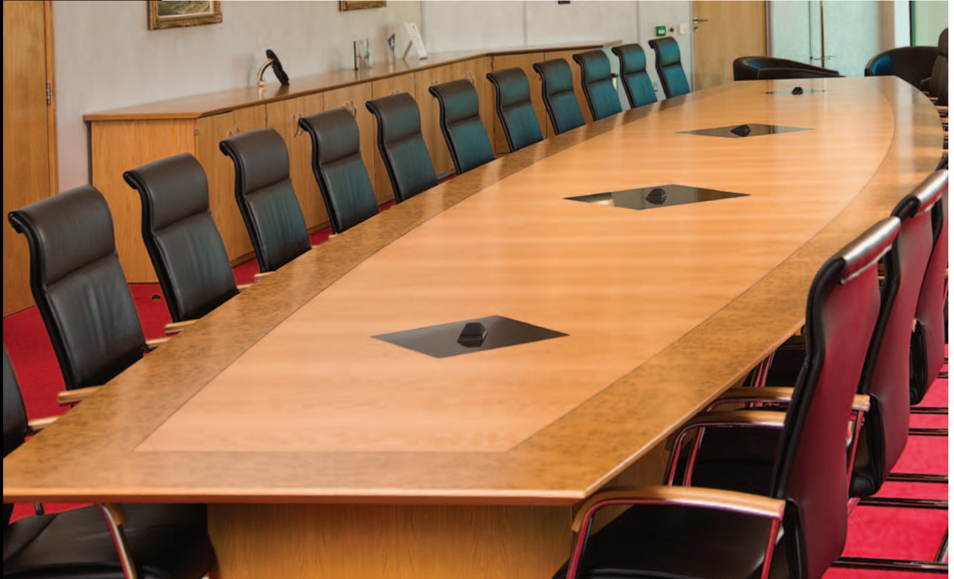
Crown cut oak veneer with burr oak picture frame border. Inset Black glass panels with microphones.