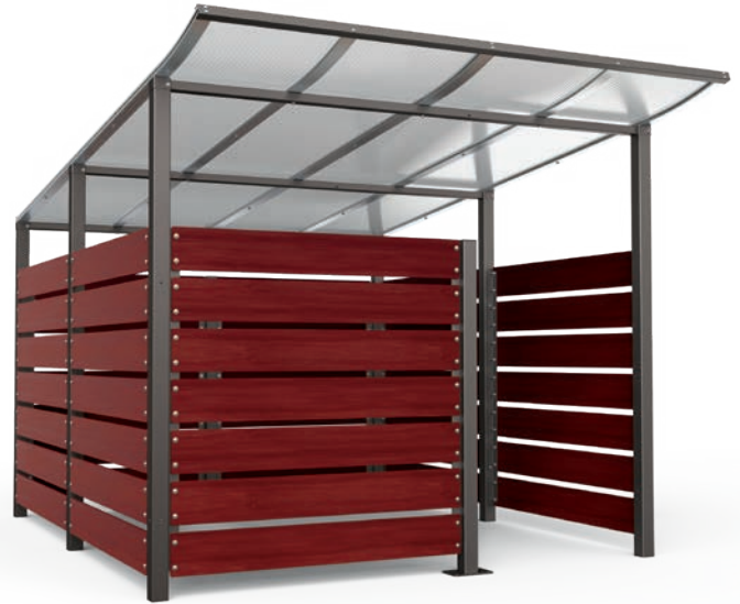
■ Codes 529782 + 529787