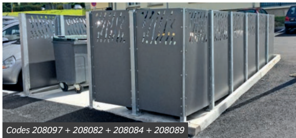
Codes 208097 + 208082 + 208084 + 208089