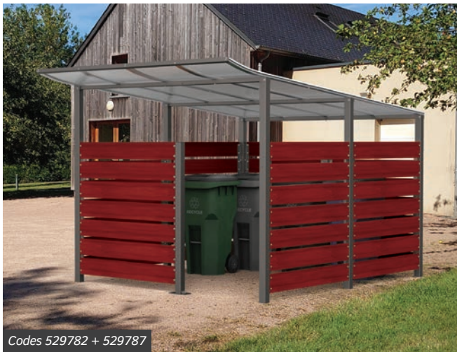
Codes 529782 + 529787