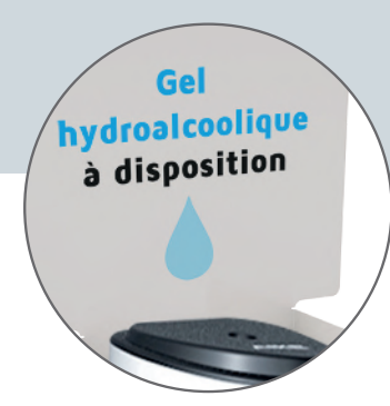
Neutral signage plate (can be personalised)