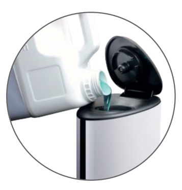
Large opening, easy and fast to refill