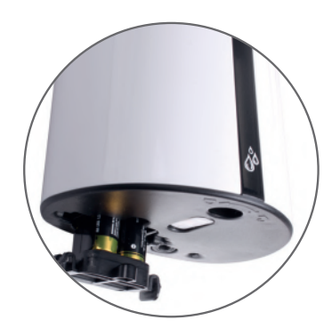
4 LR6 batteries required