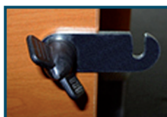
Metal connecting plates