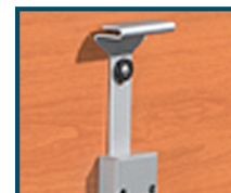
Ergonomic single handle